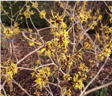
Hamamelis Mollis 'Pallida'